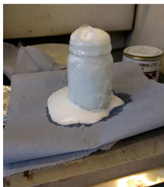
30 31 32 33 34 35 36 37 38 39 40 41 42 Figure 2: A paper towel used to facilitate clean up.

10 11 Tips for a successful experiment – The various chemicals and solutions used can 12 be pre-weighed prior to being provided to the participants. The pre-weighing is 13 especially helpful when there are a large number of participants and the availability of 14 balances is limited. The Aerolite 306 may agglomerate if added too quickly to the water, 15 16 17 18 120 if this is the case the clumps should be broken up with a spatula/glass rod to allow for 19 a homogeneous solution of urea-formaldehyde to be prepared. Before the foam begins to 20 react and harden the magnetic stirrer used to mix the reactants can be extracted 21 quickly by use of a magnetic retriever. The foam reaction vessel should be placed on top 22 of some paper towels, to facilitate a simple clean up, in cases where the foam reaction 23 24 25 26 27 28 125 escapes the reaction vessel (figure 2).