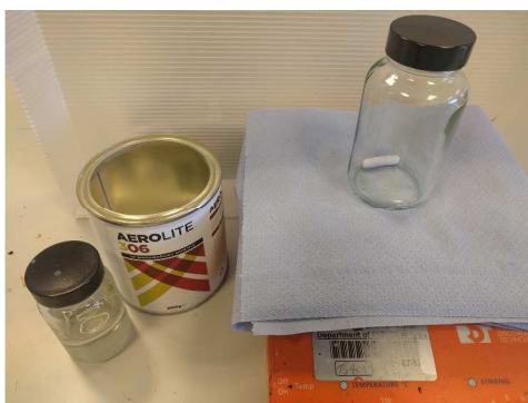
24 25 26 27 28 29 30 31 32 33 34 35 Figure 1: Equipment and materials required for the preparation of UF foam.

13 Standard laboratory glassware and apparatus are required for running the 14 15 experiment: glass or plastic bottle as reaction vessel; magnetic stirrer bar and magnetic 16 17 hot plate; solution of phosphoric acid and urea-formaldehyde (Aerolite 306); and, a 100 18 surfactant (figure 1). The various components can be pre-weighed and stored prior to 19 20 use by the teacher or technician. 21 22 23