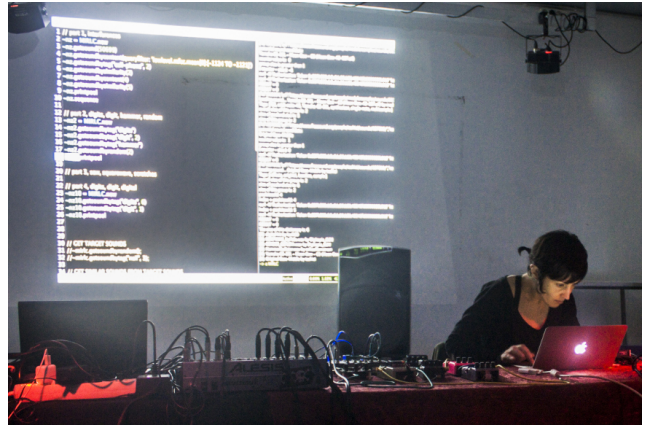
Figure 2: The first author live coding with MIRCRep at Noiselets 2017, Freedonia, Barcelona, Spain (photograph by Helena Coll).

During a first round of development, which ended with a test-bed performance (Figure 2), the tool was used to query looping sounds from Freesound using tags and similarity. 16 The theme of the concert was noise music, thus the rehearsals and performance used sound samples related to the theme. In the rehearsals, the most used pattern by the live coder was to explore the online sound database by using tags related to the concert’s theme (e.g., noise , hammer , cell-phone , digits , saw ) and then retrieve other related sounds by similarity. Getting sounds by content was less used at this stage because the parameters were too long to type (e.g., .lowlevel.spectral_complexity.mean: or tonal.key_key: ). Overall, the drawback of this approach was that there appeared unwanted sounds (e.g., a chord of a guitar), thus the serendipity became a disadvantage due to the uncontrolled random results. At the same time, the advantage was to know in advance what subspaces of the database were interesting without knowing a large heterogeneous database such as Freesound. The use of the similarity queries was found to give musically consistent results but with a certain level of unpredictability, which agrees with the literature on the difficulty of defining music similarity [14]. As areas of improvement, the search and retrieval processes could have been made more visible to both the audience and the live coder, in alignment with