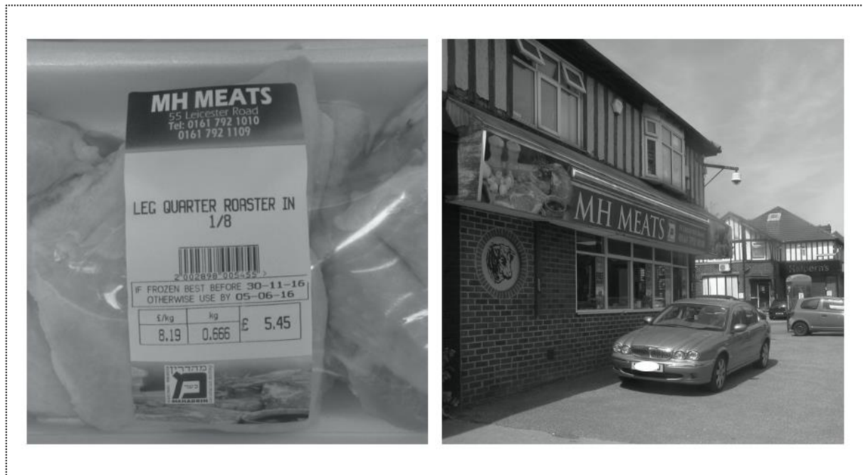
Figure 2: The Mehadrin Hechsher on kosher chicken at MH Meats

Simon, the manager at Haber's World Supermarket on Kings Road in Prestwich 14 an independent retailer licensed by MBD, described similarly how the store attracts both religious and non-religious customers looking for goods ascribed with specific kashrus qualities, although he argued that the number purchasing kosher solely for health reasons in the UK is probably much less than it is in the US. At the same time, Simon noted an interesting trend for goods such as free-range eggs being asked for in the store. Although goods ascribed with such qualities might be marketed as being healthier for animals and consumers by a wide range of food industry actors, Simon found this to be a strange development in Jewish communities, not least because, he argued, kosher is so strict with animal welfare that: 'An animal is not kosher if it has a broken bone or a bruise... so... the chicken farmers who supply the kosher trade are more careful.' Whether it be animal care or animal slaughter, the integrity of animals is critical to processes of kosher qualification, with the practices involved emphasising both the materiality and performative effects of kashrus (cf. Jackson et al., 2019).